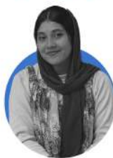
SHIZA E B SGPA 7.79