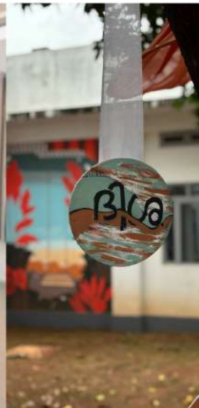
Disha Decor at the External Court