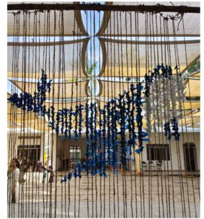
the whale in the rope installation