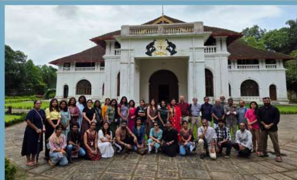
walk conducted by intach for our s9 Urban studio students