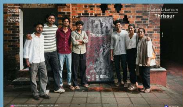
S9 students at the exhibition by Cardiff University