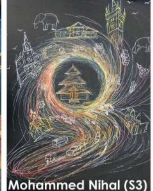
Mohammed Nihal (S3)