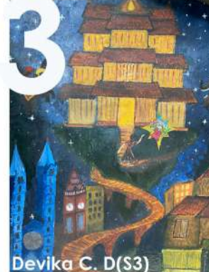
Devika C. D(S3)