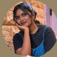
Bushra Beevi PK