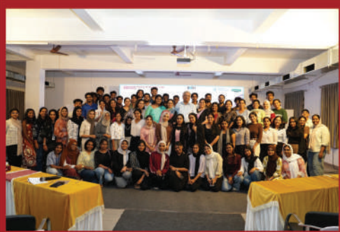
A group photograph capturing the students, faculty, and management of IESCA together in the event.