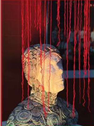
A conceptual human form model created using a thermocol base which is layered with rolled and coiled newspapers arranged in spiral patterns of varying scales by the students.