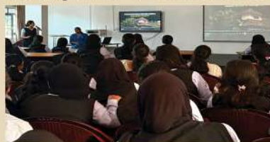
Students attending the screening of the Chelakkara Kovilakam documentary as part of Heritage Week.

Heritage is more than just the past; it is a living part of our present. During Heritage Week, we celebrate the craftsmanship and monuments that have stood the test of time