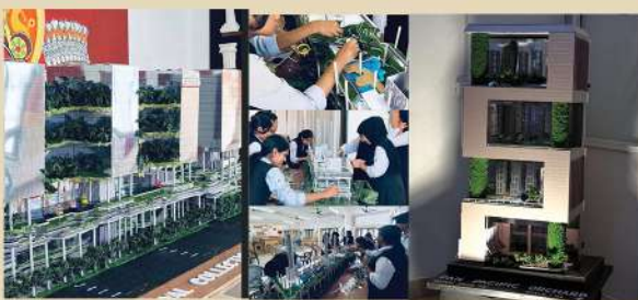
Students working on Parkroyal on Pickering, Singapore, and Pan Pacific Orchard.

S6 students carried out model making as part of a literature case study on five-star hotels. The batch was divided into two groups, studying Parkroyal on Pickering, Singapore, and Pan Pacific Orchard.