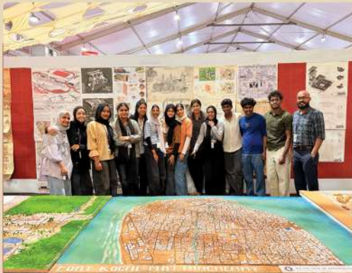
SIS2 students at the exhibition venue, surrounded by design works showcased by IIESCA College.

WELCOME BACK! Welcome to our new year edition of the IIESCA newsletter where this edition marks a new year of milestones, creativity, and shared growth. Reflecting the achievements, ideas and collective spirit of IIESCA family this issue offers a glimpse into the journey so far and the exciting path ahead