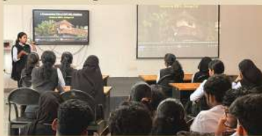
Students actively participated showcasing their knowledge of history & culture.

As a part of heritage week, students took part in a range of engaging events such as the screening of the Chelakkara Kovilakam documentary, a Heritage Photography & Sketching Competition, and a Heritage Quiz Competition held on 28.12.2025.