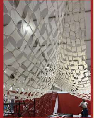
The pavilion installation, constructed using multiple small rectangular fabric pieces tied and stretched at various points to form a lightweight and dynamic spacial structure