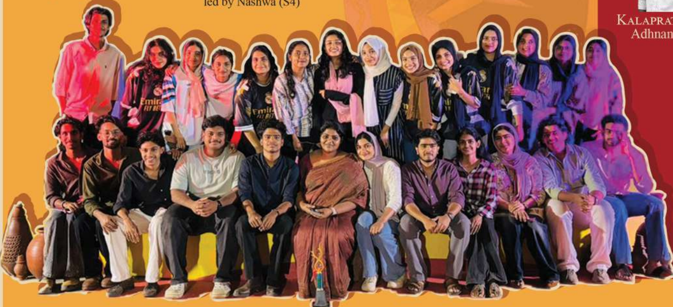
Group song by faculty