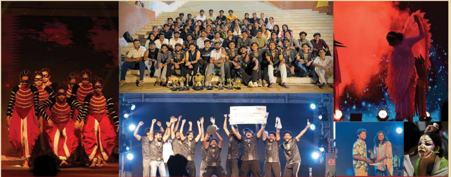
Synchronized theme dance performance