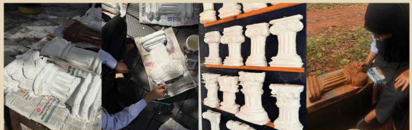
The final display of selected clay models were arranged together as an installation within the campus, presenting the outcomes of the workshop.

The Clay Workshop by Rejin sir introduced students to hands on modeling as a method to understand classical architectural orders. Through practical exploration, students created clay models of the Classical Orders, gaining insight into proportion, detailing, and the fundamentals of classical design.