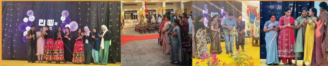
Group song by S1S2 students